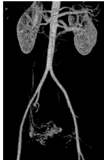
Figure 1. 3D-angio CT reconstruction of an performed in 2009 in non-pregnant condition, shows uterine AVM originating from the right uterine and ovary arteries.

An MRI and a CT in February and September 2009 confirmed the diagnosis, showing a vascular arteriovenous malformation within the right, anterior and fundic myometrial wall, reaching the endometrium and involving ipsilateral uterine vessels (Figure 1). In November 2012, she spontaneously achieved a twin pregnancy. Since uterine AVM was still present, the mother was counseled about risks related to both pregnancy and delivery. Initially, she wanted to go on with pregnancy but first one twin vanished and then a large omphalocele was found in the surviving